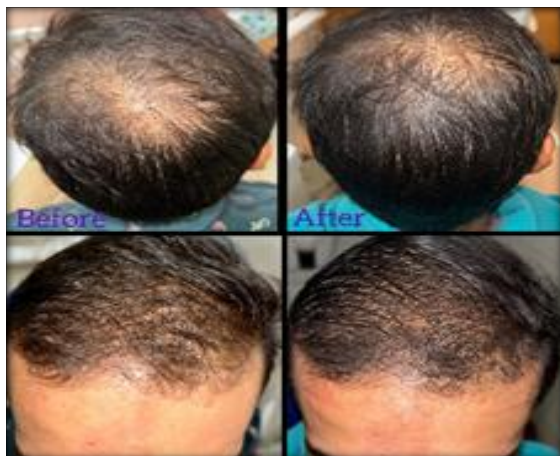
Figure 1: shows the before and after picture of the patients

Effectiveness: On comparing the global macroscopic photographs taken before and after 24 weeks of treatment, GFC therapy was observed to markedly improve the hair appearances in all the patients. The hair photomicrographs showed an evident regrowth of hair in the balding area and improved hair density after 24 weeks of GFC therapy as compared to the baseline. Figure 1 are case representatives of the effectiveness of GFC therapy in restoring hair growth after three sessions of therapy.